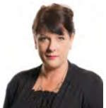
Rhianon Passmore AM Welsh Labour Islwyn