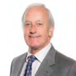
Neil Hamilton AM UKIP Wales Mid and West Wales