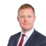
Jeremy Miles AM Welsh Labour Neath