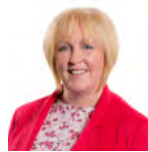
Suzy Davies AM Welsh Conservatives South Wales West