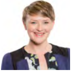
Bethan Sayed AM Plaid Cymru South Wales West