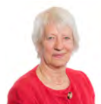
Jenny Rathbone AM Welsh Labour Cardiff Central