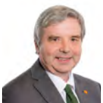
Dai Lloyd AM Plaid Cymru South Wales West