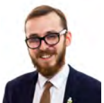
Jack Sargeant AM Welsh Labour Alyn and Deeside

The following Members were also members of the committee during this inquiry: