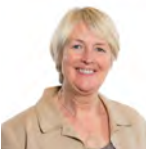
Siân Gwenllian AM Plaid Cymru Arfon