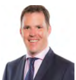
Lee Waters AM Welsh Labour Llanelli