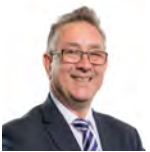
Mick Antoniw AM Welsh Labour Pontypridd